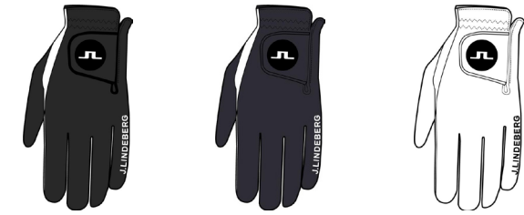
9999 BLACK 6855 JL NAVY 0000 WHITE

SIZE: 40-45 MATERIAL: 85% POLYAMIDE / NYLON 35% POLYPROPYLENE 21% LYCRA