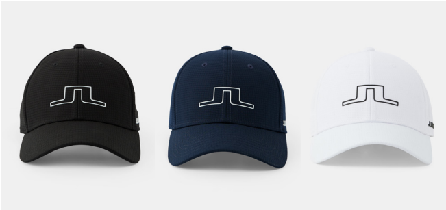
9999 BLACK 6855 JL NAVY 0000 WHITE

Our iconic cap in breathable ripstop mesh structure fabric for better ventilation and sporty look.