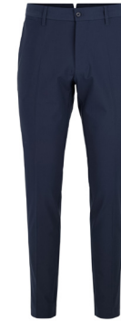
6855 JL NAVY