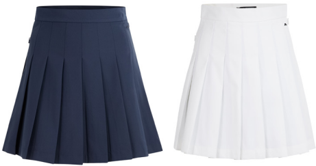
6855 JL NAVY