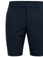
6855 JL NAVY